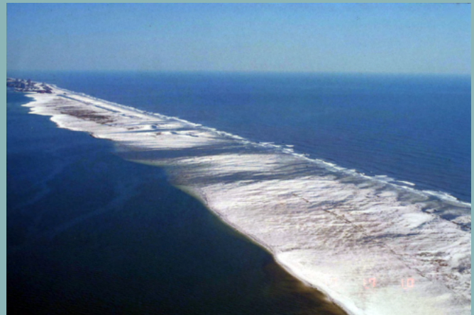
Example: Low barrier island topography with a small breach that is due to landfall of Hurricane Ivan, 2004.

The changes seen in Louisiana result from losing the sediment source of the Mississippi River tributary that abandoned this region; however, the situation provides a rare glimpse into how coasts can respond to a high rate of sea-level rise.