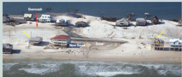
Example: The top photograph in each pair was obtained prior to landfall of (left) Hurricane Frances and (right) Hurricane Ivan, both in 2004. Frances made landfall along the Atlantic coast, and Ivan made landfall along the Gulf of Mexico coast on Florida's panhandle.