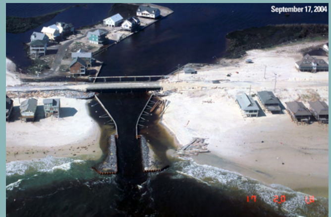
Example: Damage to bridge and roadway, Gulf Shores, Alabama. Hurricane Ivan, 2004.