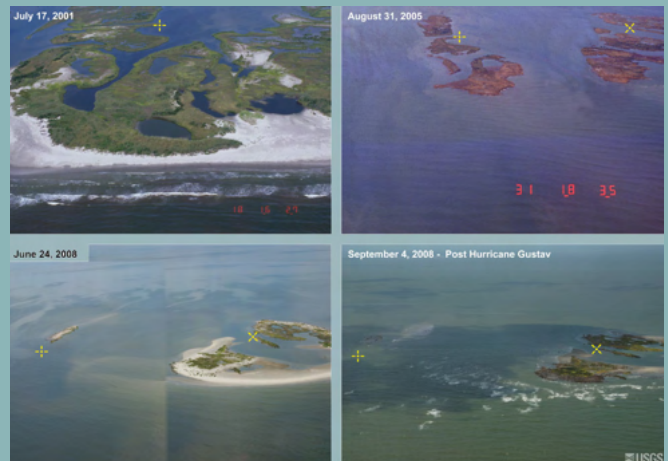
Example: Progressive land-loss of the Chandeleur Barrier islands. The islands are increasingly dissected as the beach is lost, breaching prevails, and marsh lands erode.