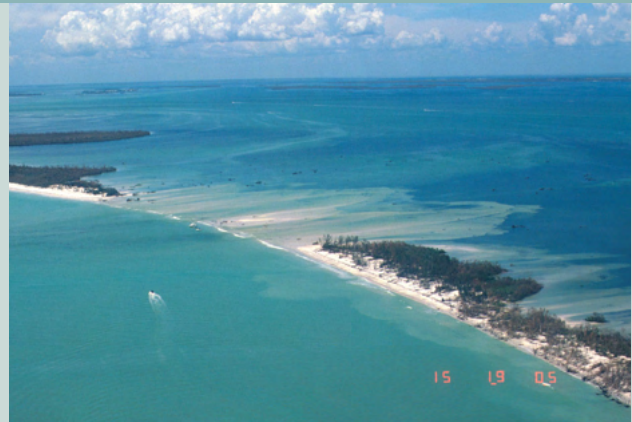
Example: North Captiva Island, Florida, breaching as a result of the landfall of Hurricane Charley in 2004.

Even with beach nourishment and other mitigation efforts, there will be an increase in the impacts on coastal infrastructure. This is an ongoing problem